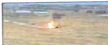
IDF observers identify terrorists storming the fence, and activate remote firing systems until they run out of ammunition