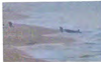
Five terrorists on a boat evade the Israeli navy and storm the beach. Soldiers exchange fire with them